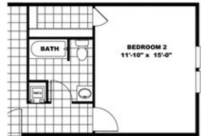
OPTION 2 BEDROOM

Our home building facilities invest in continuous product and process improvements. Plans, dimensions, features, materials, specifications and availability are subject to change without notice or obligation. Renderings and floor plans are representative likenesses of our homes and may differ from the actual homes. We invite you to tour a Home Center near you and inspect the highest value in quality housing available or call (828) 456-2822 to speak with a Home Consultant. Copyright 2017, CMH. All rights reserved.